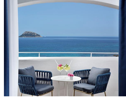
DELUXE ROOMS 22 m<sup>2</sup>

The <u>Beach Hotel</u> is comfortably located closer to the beach and with common areas and rooms recently renovated. In this area are located the Superior and the Superior Sea View Rooms with their own reception (open in high season). Most of them with balcony.