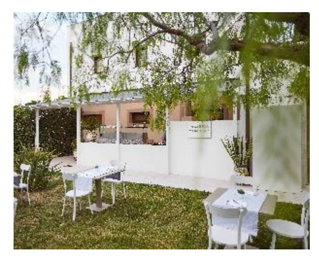
Grill and Pizzeria Timilia:

SPECIAL DINNERS : Once a week a Gala and a themed dinner will be offered; our guests can also taste some local and street food offered by local companies which will show and describe their high-quality products.