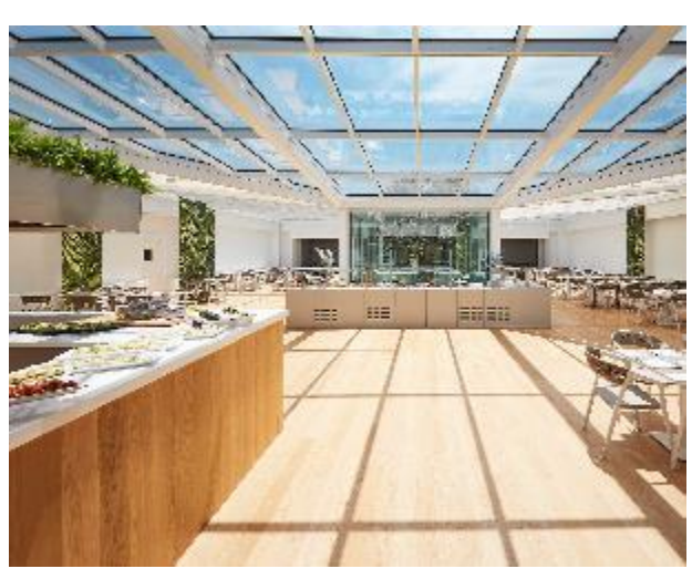
Il Baglio main restaurant:

Full board with beverages formula: buffet International breakfast, lunch and dinner (at the Restaurant "Il Baglio" and for a snack light lunch, upon reservation, also at the Beach Bar "Ossi di Seppia") with bottled water and soft drinks at meals.