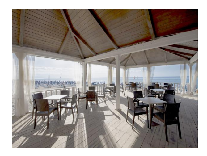
Snackbar La Terrazza:

Meals in a dedicated area, in the heart of resort near Piazzetta bar. It offers specific menus for kids together with VOI Staff. Open from 10/06 to 09/09.