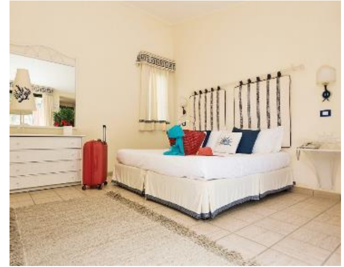
CASBAH SUPERIOR 30 m 2

Bungalows located in the central area of the resort and close to the main services, with 2 beds and one sofa bed, 300 to 600 meters away from the beach. Meals at the Oasys Restaurant with free tables outside or in the air-conditioned indoor rooms.