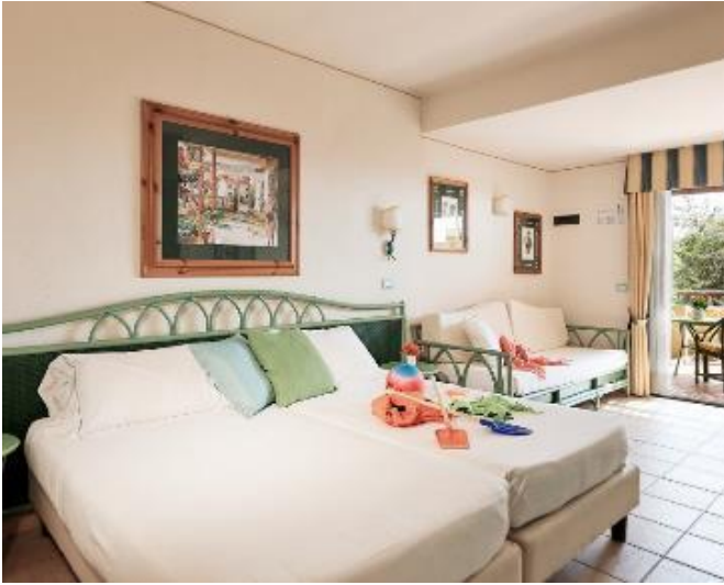
MONTE GARDEN & MONTE SUPERIOR 25 m 2

The 870 rooms of the resort, available in different typologies, are equipped with all comforts: air conditioning, hairdryer, telephone, satellite TV, minibar, safe; most of the rooms with furnished patio or terrace. They are divided into: