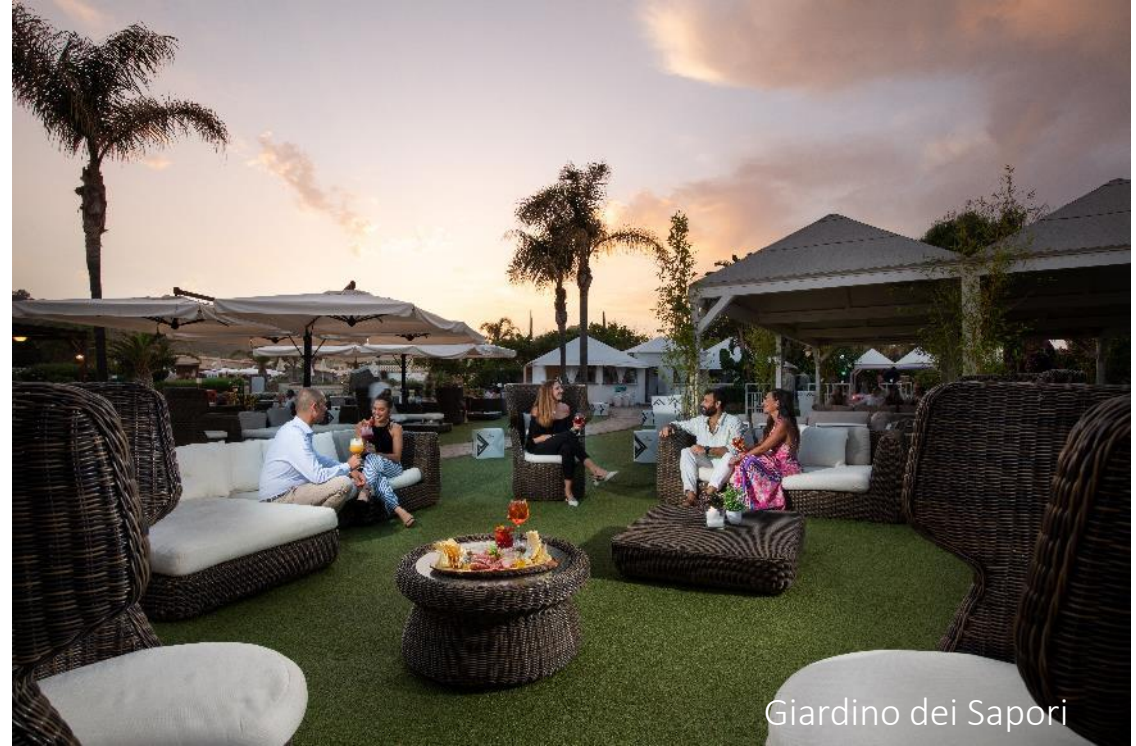
Giardino dei Sapori