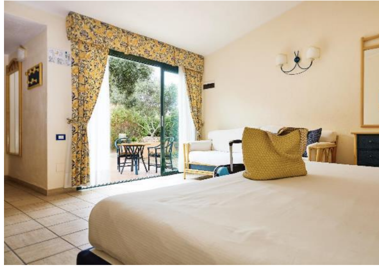
CASBAH STANDARD 30 m 2

Bungalows located in the hilly and panoramic area of the resort, surrounded by greenery, have 2 beds and one sofa bed; Monte Garden are located between 600 and 800 meters from the beach, Monte Superior between 400 and 600 meters. Meals at the Oasys Restaurant with free tables outside or in the air-conditioned indoor rooms.